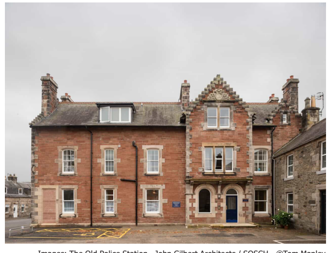
Images: The Old Police Station. John Gilbert Architects / SOSCH

South of Scotland Community Housing Trust