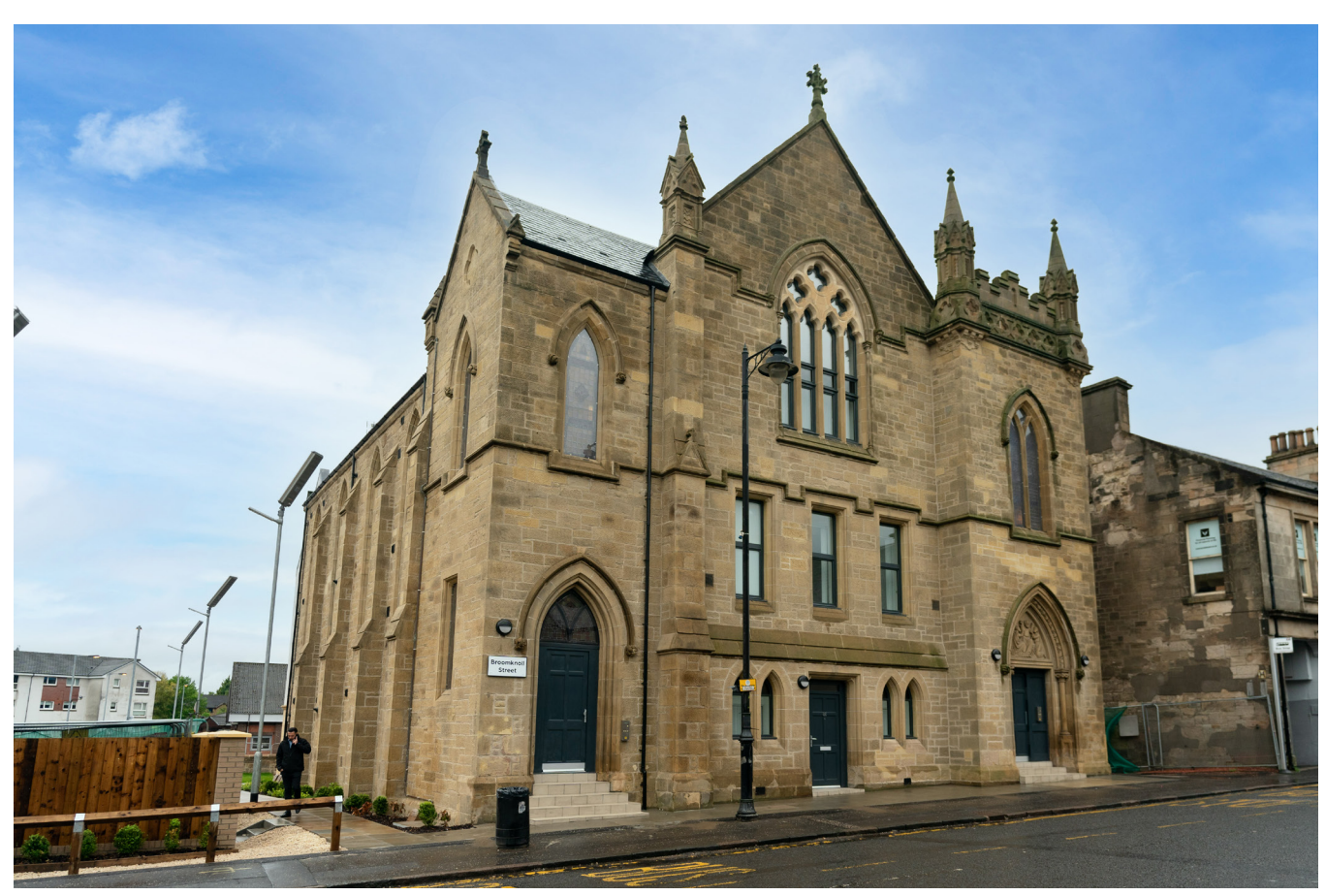
Image: Broomknoll Church Court, Airdrie. ©Clyde Valley Housing Association

Redevelopment of a former church plus adjacent new build to create 30 new town centre flats for social rent. The Category C listed heritage building lay vacant for ten years before being taken on by Clyde Valley Housing Association, with support from Scottish Government and North Lanarkshire Council. Planning consent was granted in 2018 with work starting in 2020 and completing in 2022.