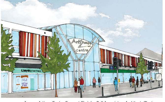
Image: Artizan Centre Concept Sketch. Bell Associates, Architects/Designers