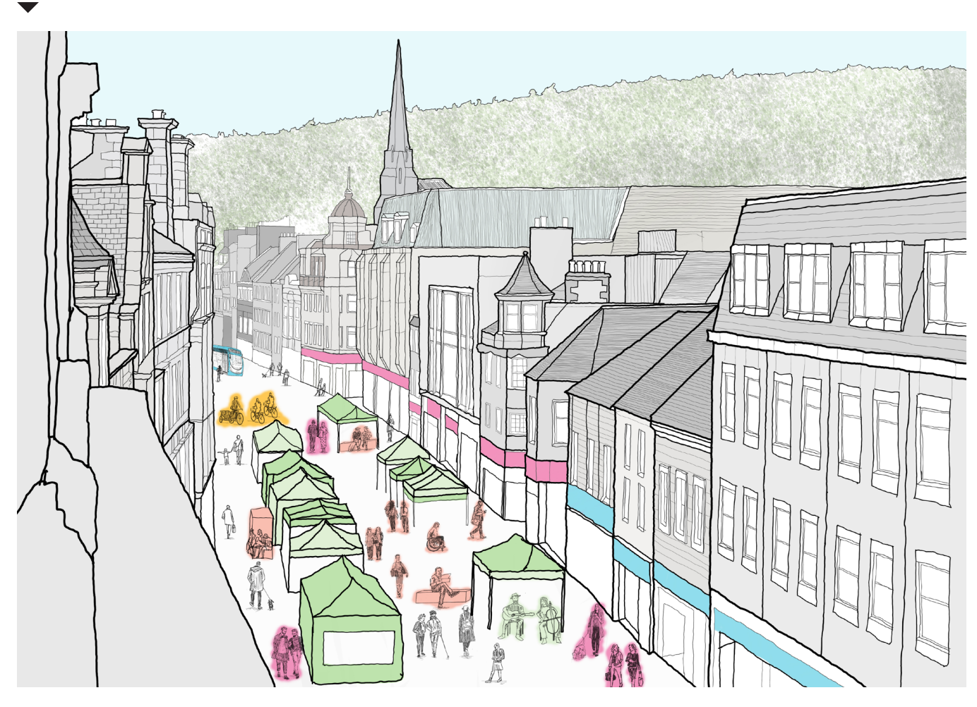
Figure 1: What People Bring