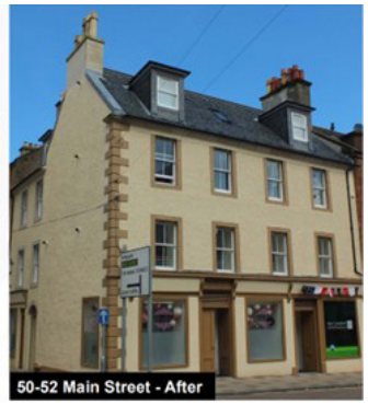
Campbeltown Main Street, before and after CARS