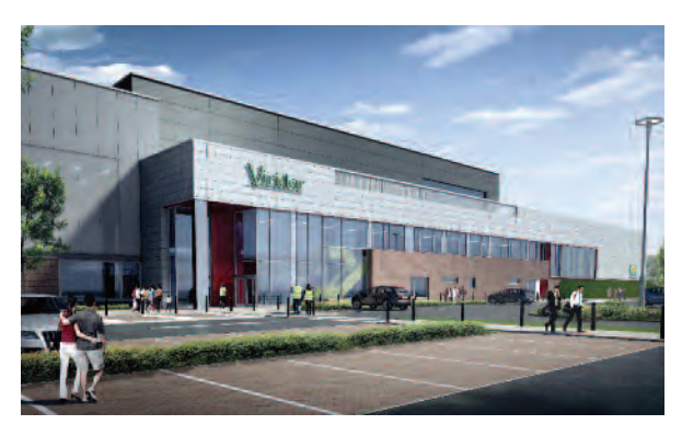
Above: Artist's impression of the new Viridor Facility in Glasgow.

In a similar vein, SFT has played a key role in supporting both the food and residual waste projects for Edinburgh and Midlothian. Both projects are well advanced and SFT will continue to support the Councils as these projects progress from procurement into construction.