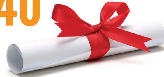
New apprenticeship positions generated