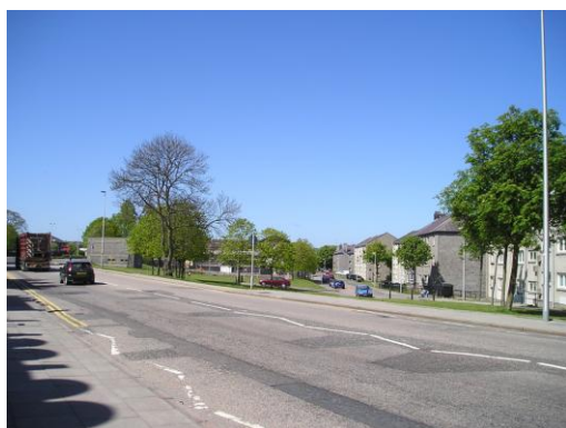
View towards existing Health Centre

The development replaces the existing Health Centre with a new purpose built facility that will also include services transferring from other clinics. The total accommodation schedule at feasibility stage totals approximately 1,615m 2 and the capital construction related costs have been provisionally identified in the region of £4.68million.